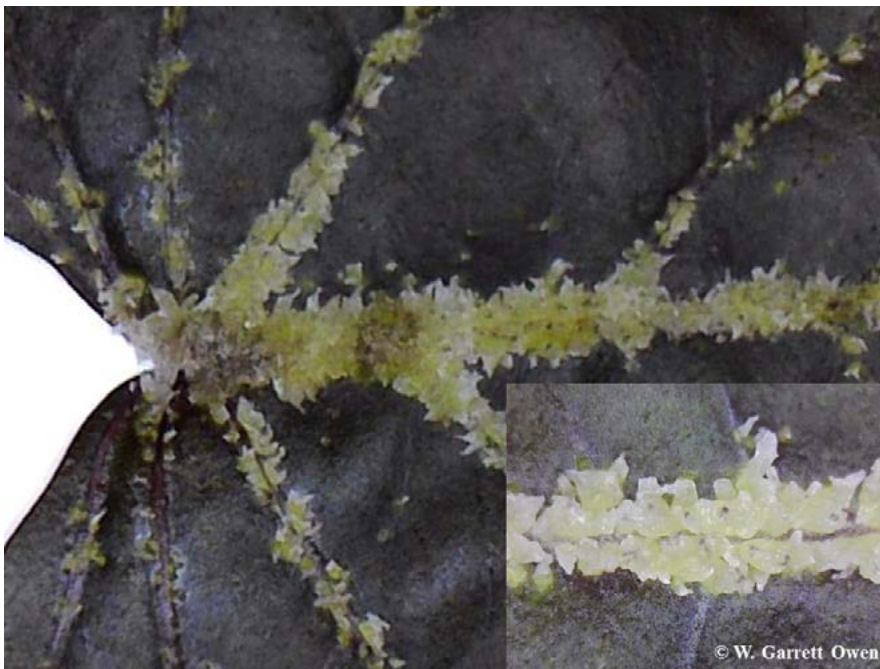
Figure 3. Small green bumps protrude out from the leaf surface, turning translucent or white along the mid-rib.