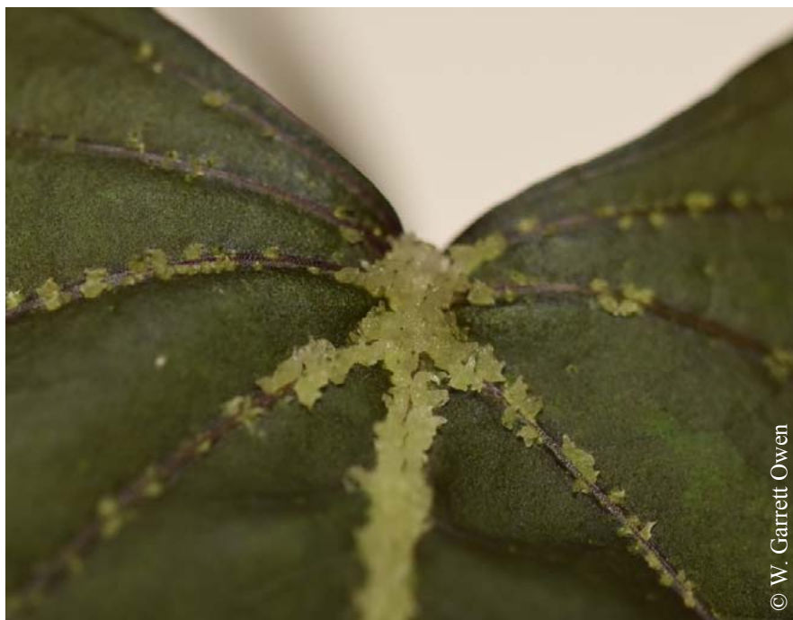
Figure 4. Microscope view of enlarged translucent lesions present along the mid-rib of an ornamental sweetpotato leaf.