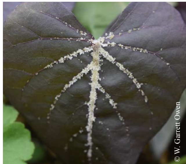
Figure 1. Mature leaves of sweetpotato vines exhibiting abnormal, translucent out-growths on the upper leaf surface.