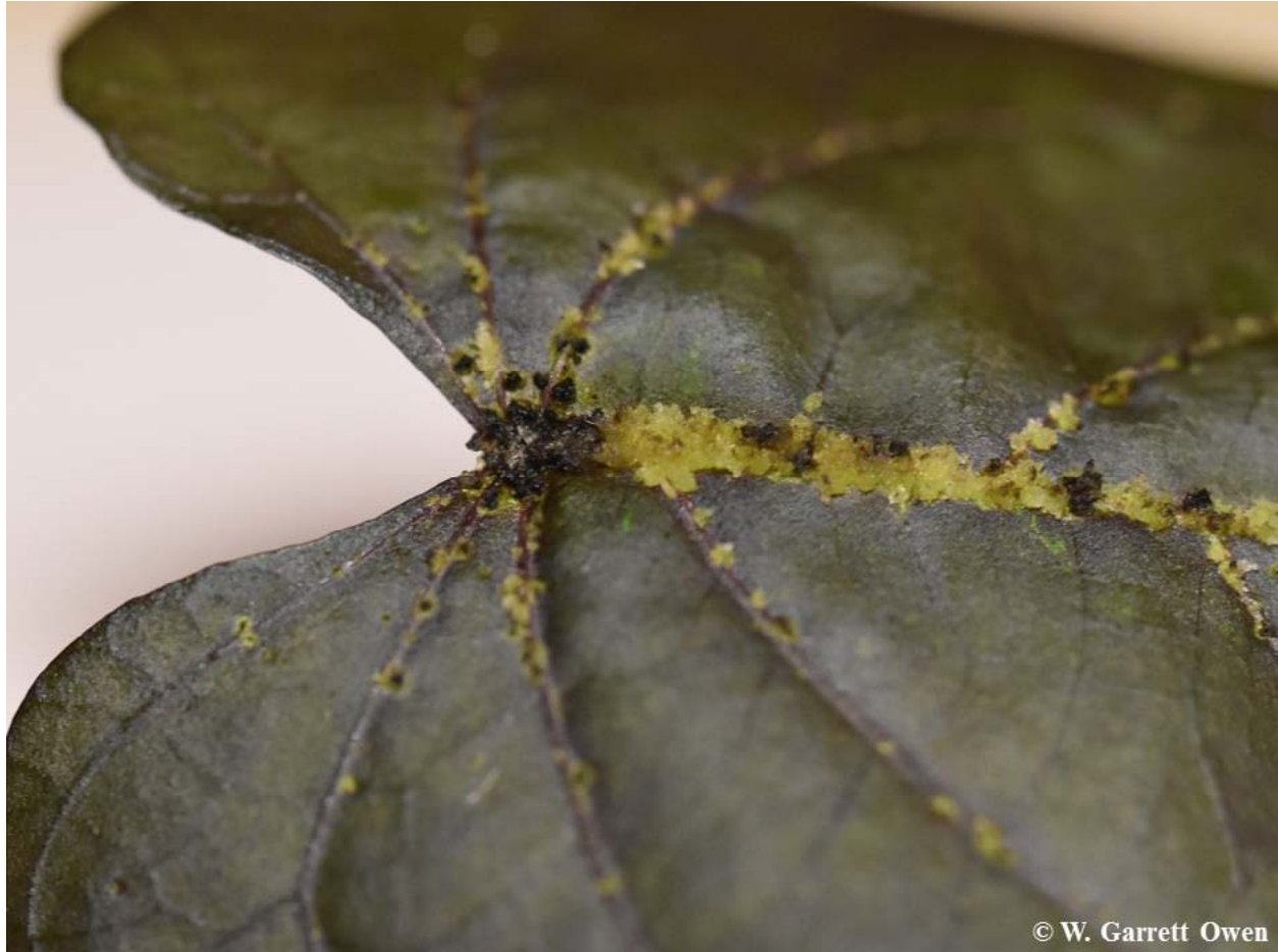
Figure 6. Translucent out-growth turn black and become dry.